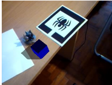
Figure 4: A comparison between the OpenGL rendered shadow (bottom) and the real shadow (top)

To produce convincing CG that will blend into the environment, lighting and shadow are also important. Conventional method such as using Maya will produce the shadow as a stage after the CG elements are in place. I aim to produce the shadow in real-time together with the CG elements as well by using OpenGL. And again, the shadow will be rendered as separate layers as image sequence for further post production if required. MXRToolkit does not provide shadow rendering, hence I am writing this part myself. The result looks promising on OpenGL primitive polygon (Figure 4), and I am still currently trying to extend it further for other 3D model formats (which seems to take longer than expected).