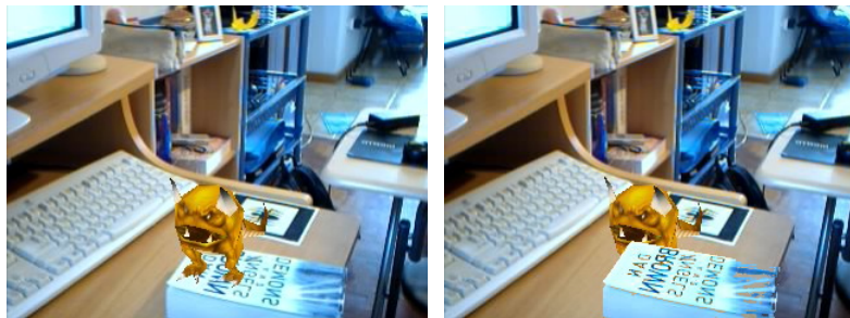
Figure 3: CG element occluding real object on the left when it is supposed to be “behind” the object. On the right, the book occluding the CG elements on the right after post production using clean plate technique.

Another problem is the occlusion problem - CG elements can only be rendered on top of the video, occluding every other real scene objects. To overcome this, the occluding real object is shot separately and superimposed later using clean plate technique. Figure 3 shows the result.