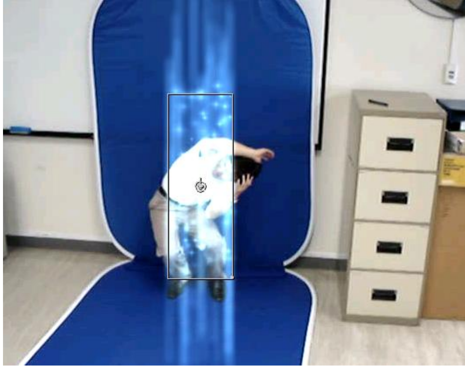
Figure 3: Particle Effect Trial 2