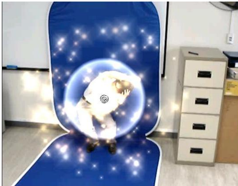
Figure 2: Particle Effect Trial 1