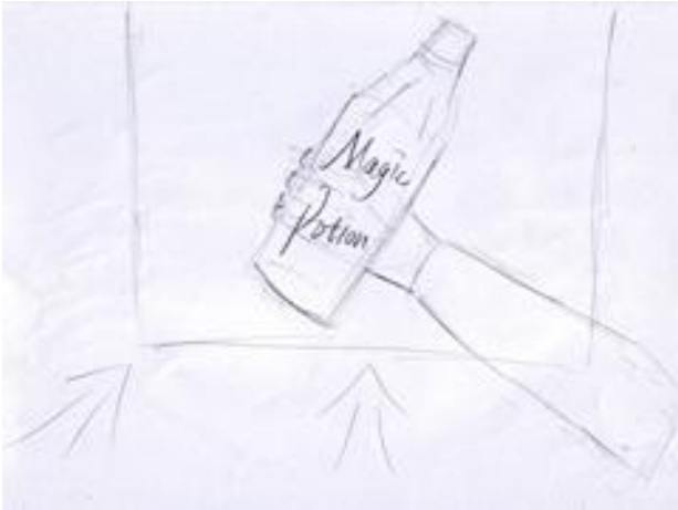
7) The bottle with the name "Magic Potion". (Close up shot, zooming in to capture the name )