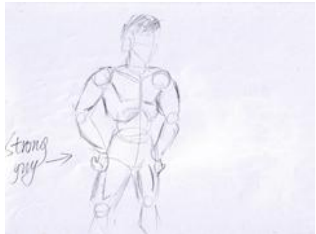
4) The girl turns to a strong guy beside the thin guy. (Mid shot)