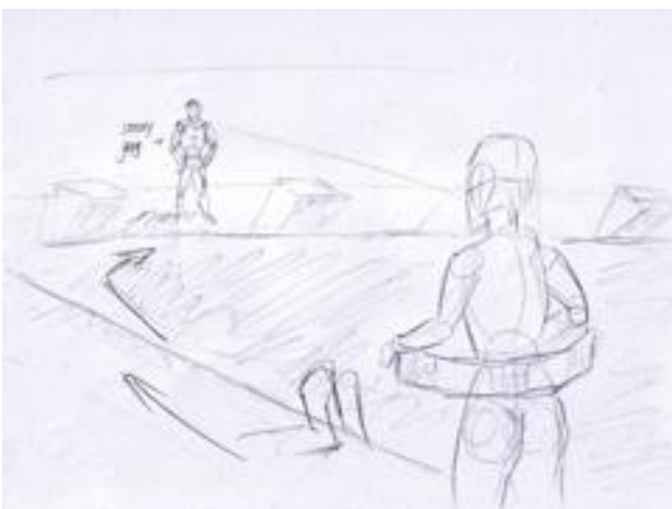
5) She chooses the strong one, walks to him. (Wide shot, until the girl reaches the guy)