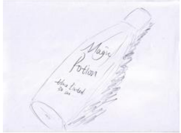
14) The bottle with the name "Magic Potion". (Close up shot, show the words "time limit: 30 sec" )