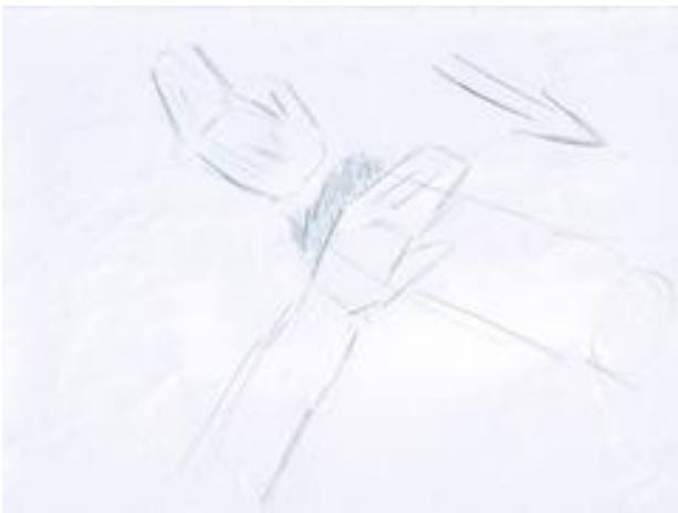
9) He puts the liquid on his arm from wrist to elbow. (Close up shot, the arm starts to expand with the potion)