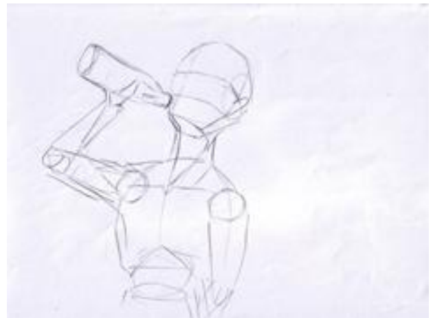
10) The guy swills the potion. (Mid shot)