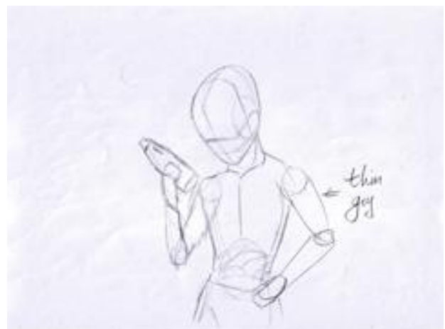
6) The thin guy is jealous and takes a bottle from his bag. (Mid shot)