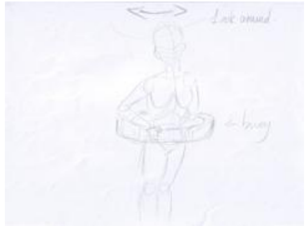
2) The girl with a buoy is also looking around. (Mid shot)