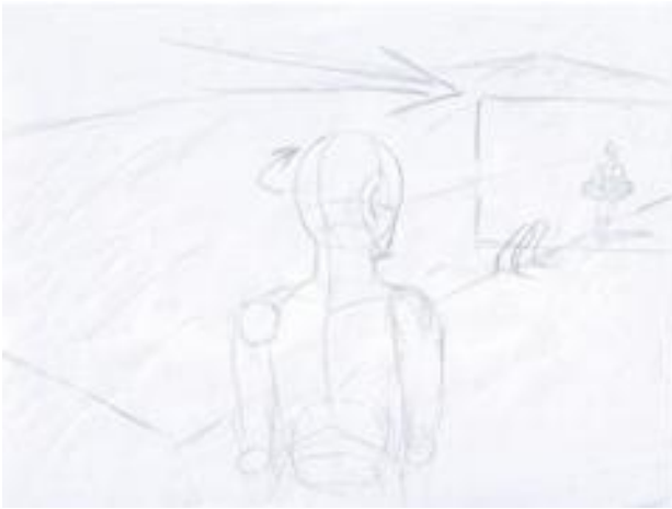
1) The thin guy looks around to find the girl. (Wide shot, zooming in to capture the girl)