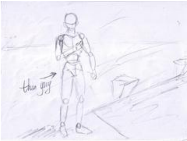
3) The girl looks at the thin guy. (Wide shot)