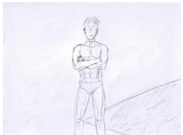
12) He stands up and turns to a very strong guy. (Mid shot)