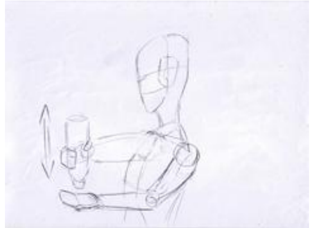
8) The guy spills the liquid to his hand. (Mid shot)