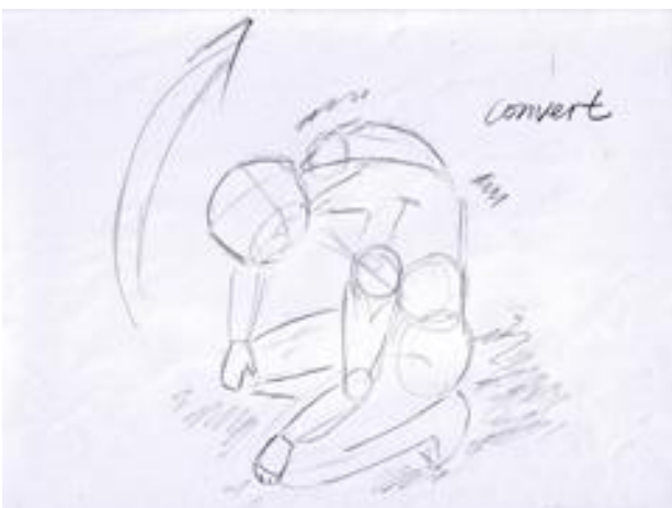
11) Then he squats and is converted by the potion. (Close up shot, muscle expanding)