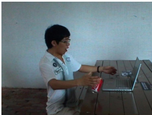
Figure 4: Shocked Actor A