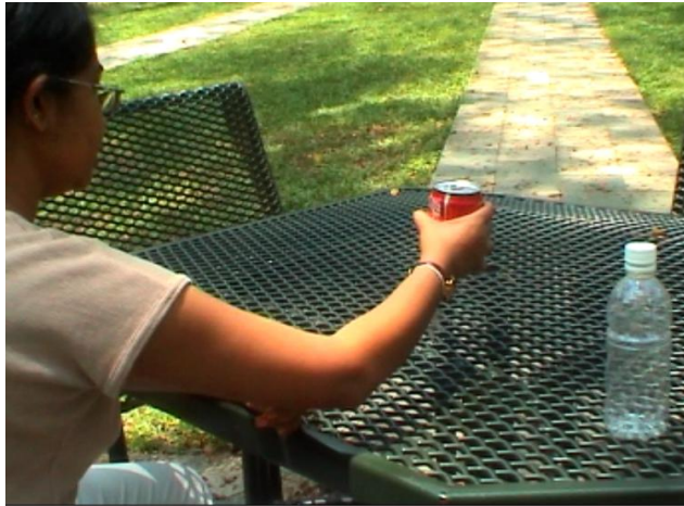
Figure 8: Getting Drink from Actor B's Angle