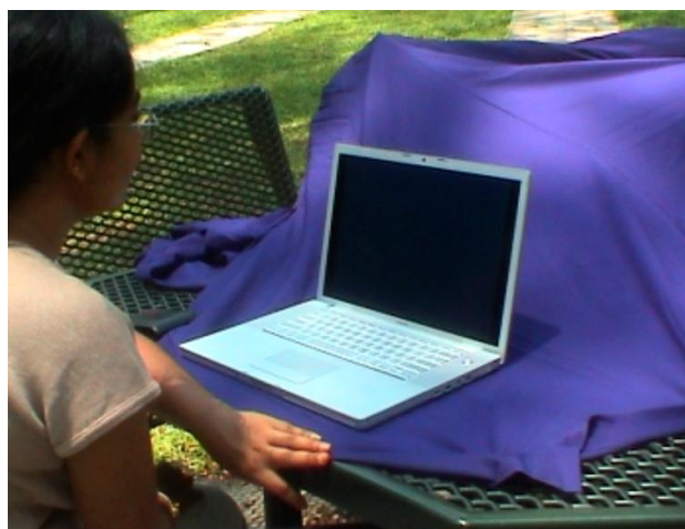
Figure 7: Laptop with Blue Background from Actor B's Angle