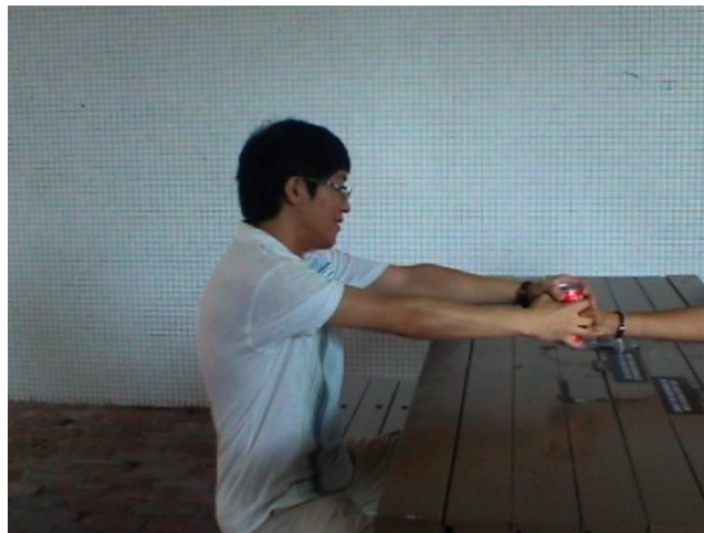
Figure 1: Fighting from Actor A's Angle