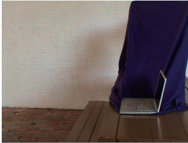
Figure 2: Laptop with Blue Background from Actor A's Angle