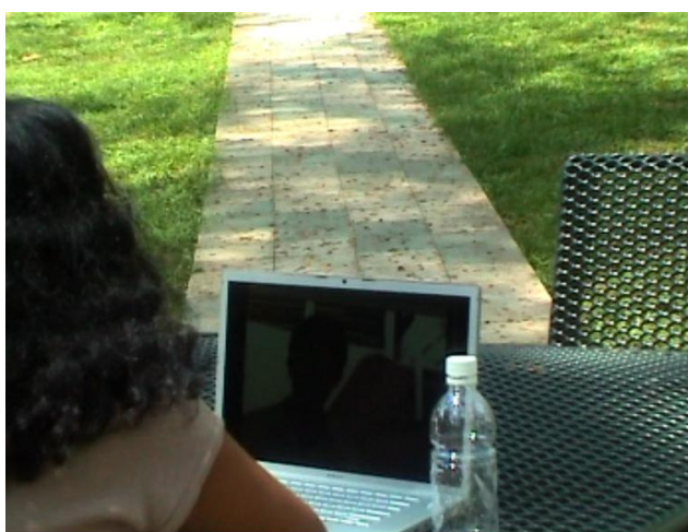
Figure 6: Chatting from Actor B's Angle