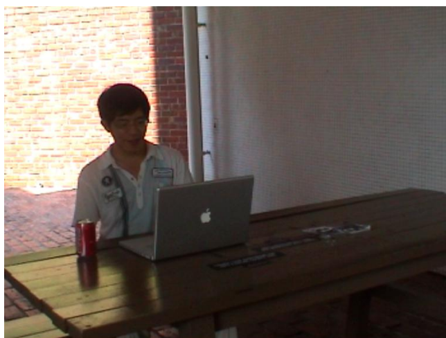
Figure 5: Chatting from Actor A's Angle